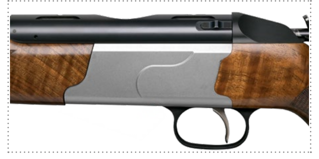
Standard – nickel finish Nickel plated action finish without engraving.