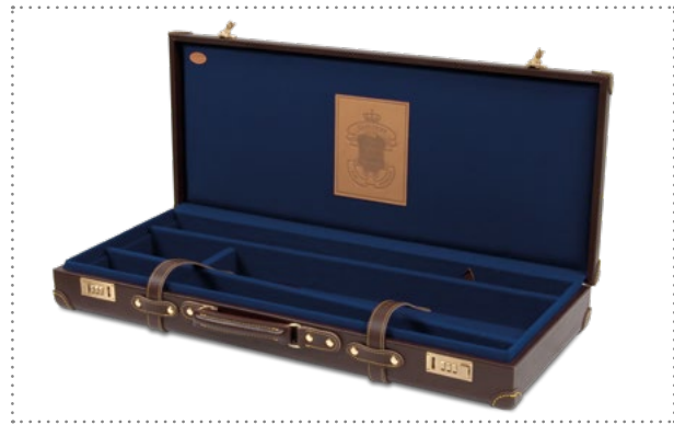
Gun Case line in "Alba" leather-style