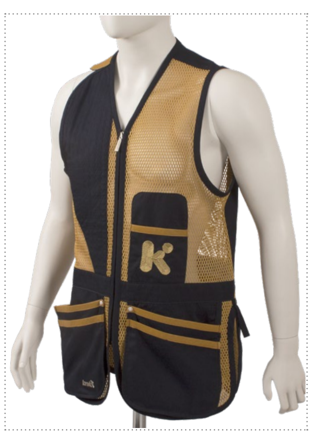
Shooting Vest Sporting "London" gold