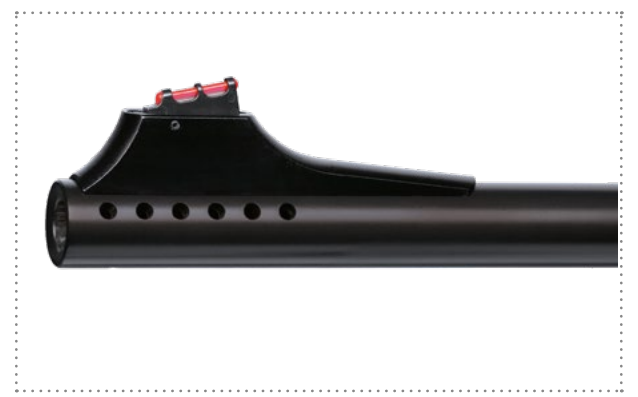
Barrel porting for Semprio