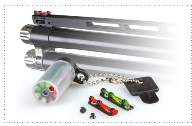
Krieghoff HiViZ Pro Shotgun Sight