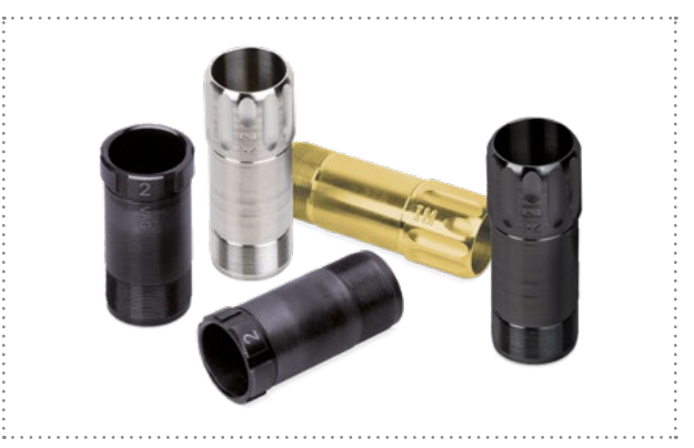
Factory chokes (black), optional titanium chokes (polished) and optional titanium chokes gold plated