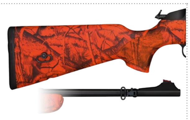
Semprio - "Compact" version, with additional sling swivels on the side of forend and buttstock \,