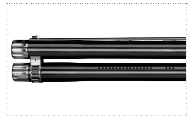
Barrel porting for K-80