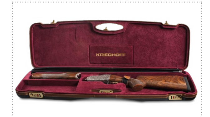
Krieghoff Gun Case for K-80 / K-20 – premium edition