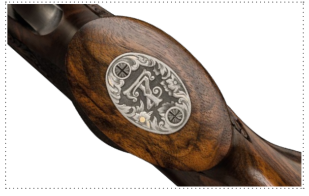
Inlet into pistol grip cap with custom engraving