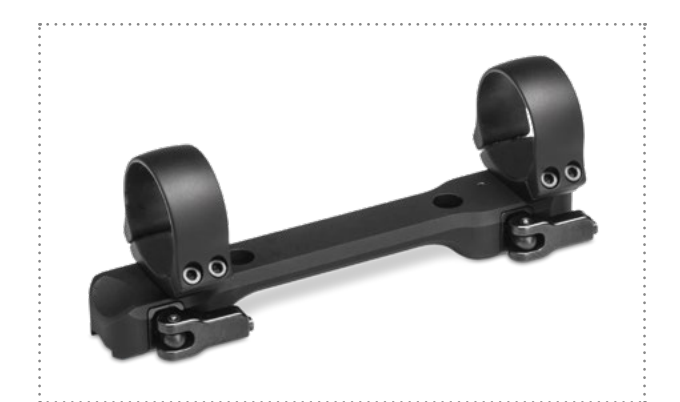
Semprio Pro Mount