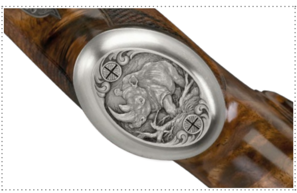
Steel pistol grip cap with custom engraving