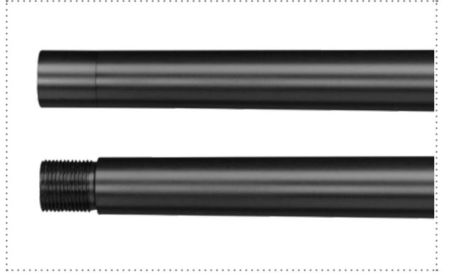
Muzzle threading with and without individually adapted thread cover bushing