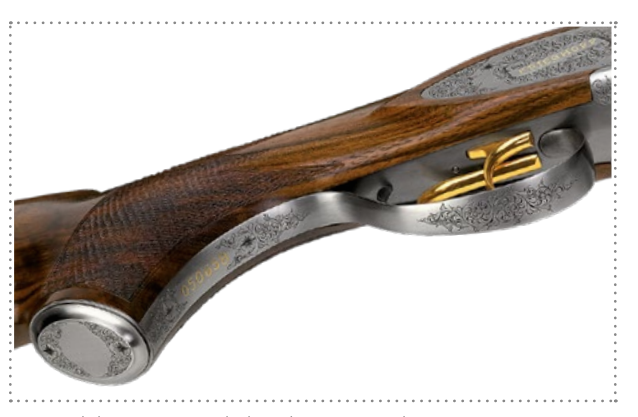
"Imperial design" – extended steel trigger guard