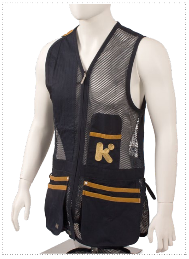
Shooting Vest Sporting "London" navy