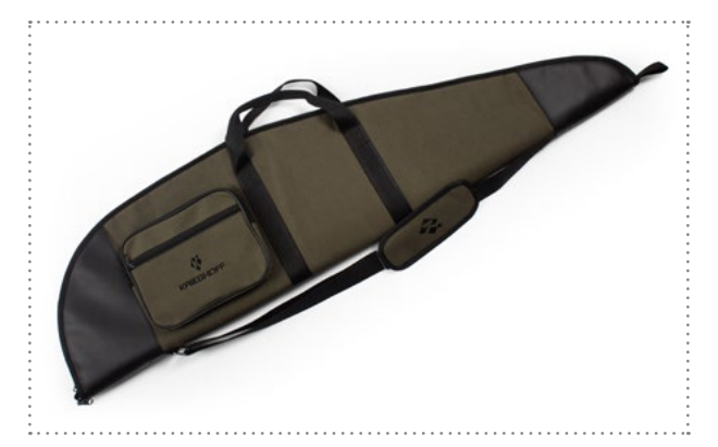
Krieghoff Gunslip hunting green