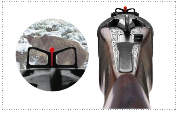
Krieghoff see through sight for hunting guns