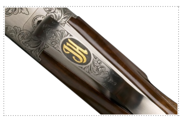
Monogram in gold on the trigger guard