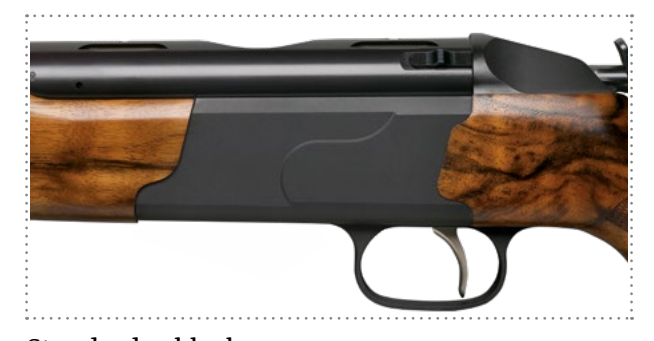
Standard – black Black anodized action finish without engraving.