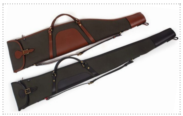
Krieghoff Gunslip Canvas/Leather