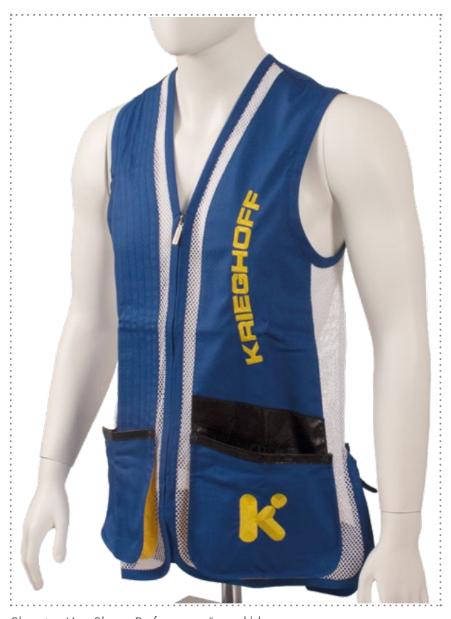
Shooting Vest Skeet "Performance" royal blue