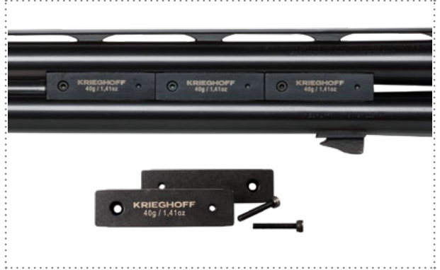
Krieghoff Balance System – barrel weights