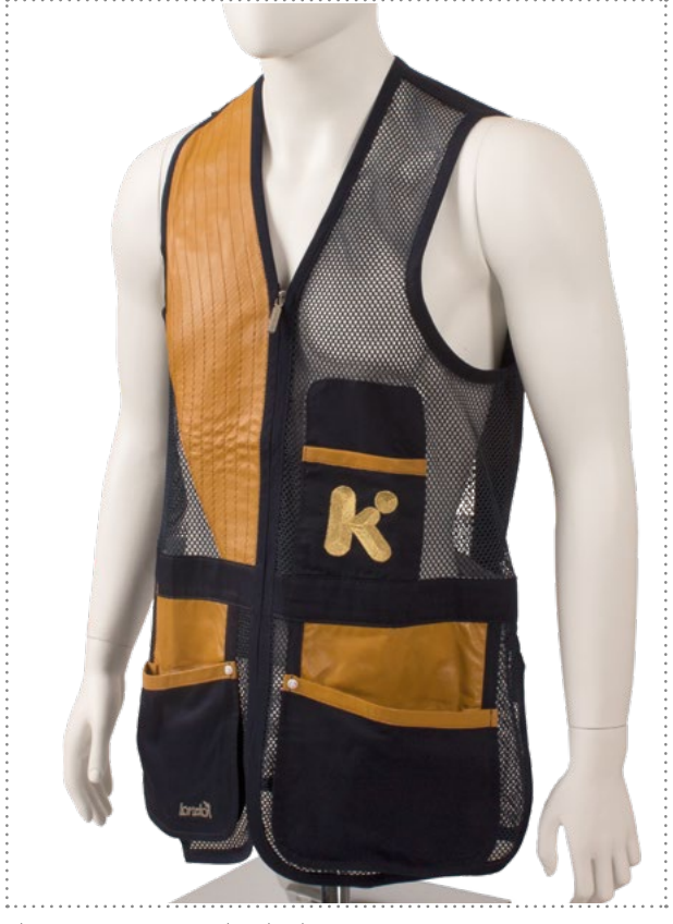
Shooting Vest Trap "London" leather, navy