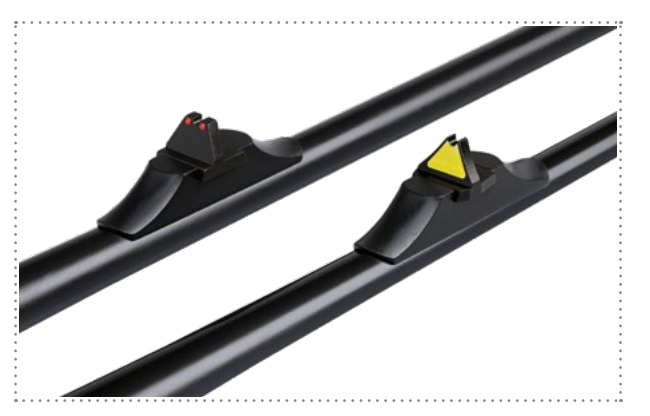
Krieghoff sight with fluorescent beads, for Semprio