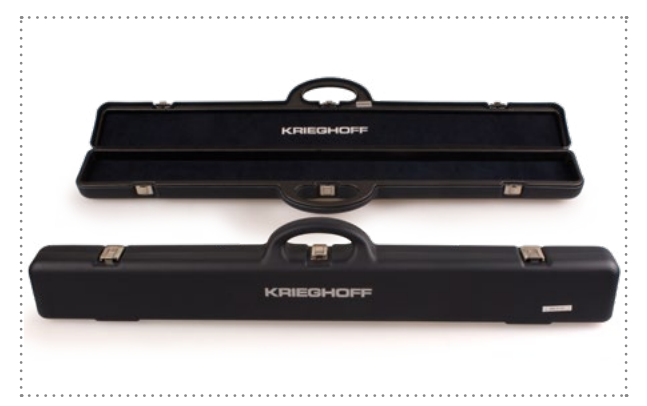
Krieghoff barrel case