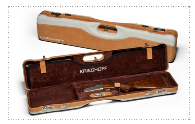
Krieghoff Gun Case Victoria