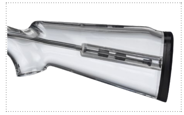
Krieghoff Balance System – stock weights