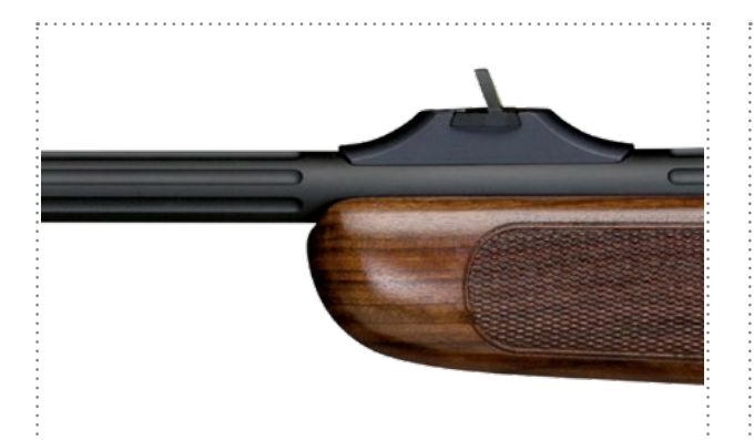
Fluted barrel for Semprio