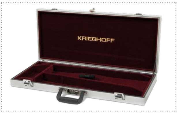
Aluminium Gun Case