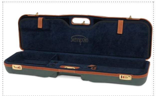
Krieghoff Gun Case for Semprio – Premium Edition