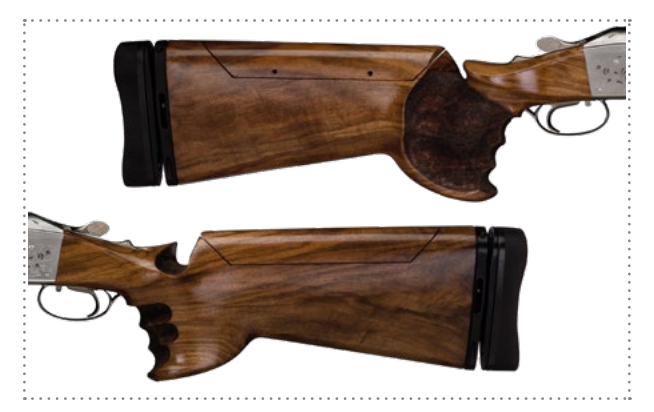
Custom made stock with ergonomic grip and finger grooves as well as an adjustable butt plate